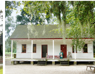
5 Eliza's House