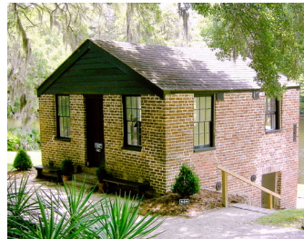
3 Plantation Chapel