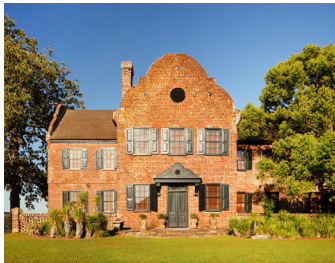
2 House Museum